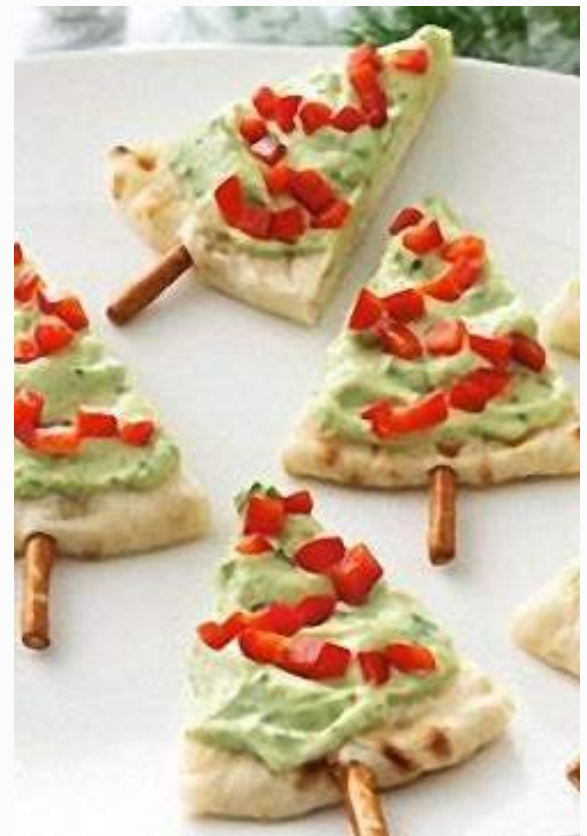
Suggested Christmas appetizer idea